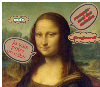
GRADE 5 TO GRADE 12