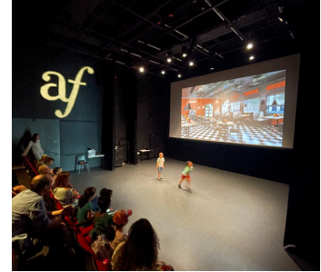
KINDERGARTEN TO GRADE 4