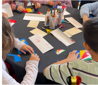
KINDERGARTEN TO GRADE 4