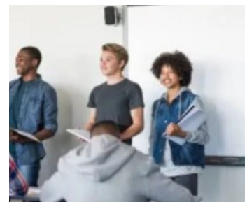
GRADE 8 TO GRADE 12